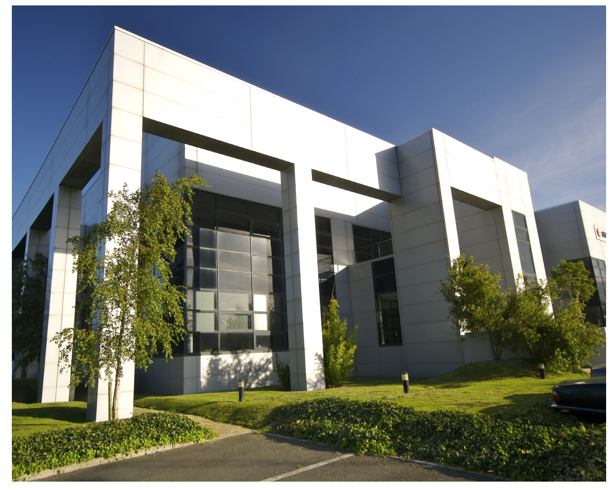
Keppel Data Centre, Dublin

Currently, Keppel DC REIT's portfolio comprises more than 15 data centres in Asia Pacific and Europe.