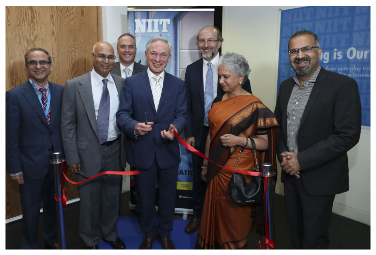
NIIT office inauguration

"There is very good industry, academia and government collaboration. Companies can access research, people, and great technology partners to develop prototypes and so on. R&D funding and support are very good as well. You can create intellectual property in Ireland and that property is safe."