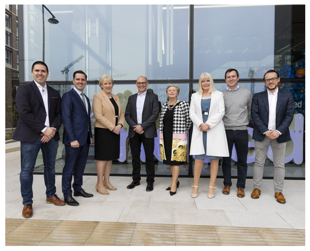
The opening of Indeed's Capital Dock office in Dublin

Indeed is also Ireland's number one job site with a very impressive 3.6 million monthly visits.