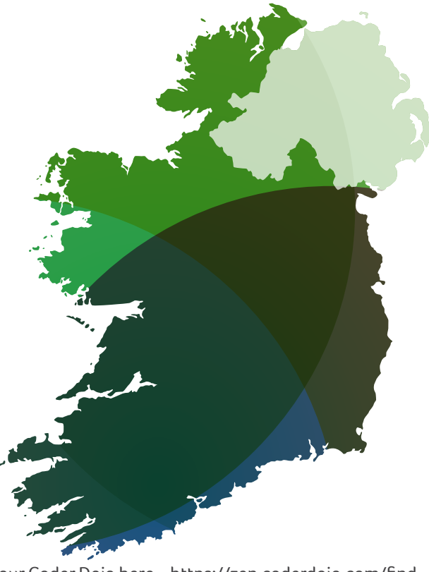
Find your Coder Dojo here - https://zen.coderdojo.com/find